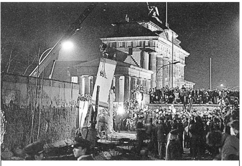
The Fall of the Berlin Wall in 1989

together in a city which was the symbol of extreme separation from 1945 to 1990. Berlin, the capital and largest city of Germany was the site of the Berlin Wall which symbolized the division between East and West. After the reunification of Germany in 1990 we have seen a continuing growth of Unity all over Europe. Our work of